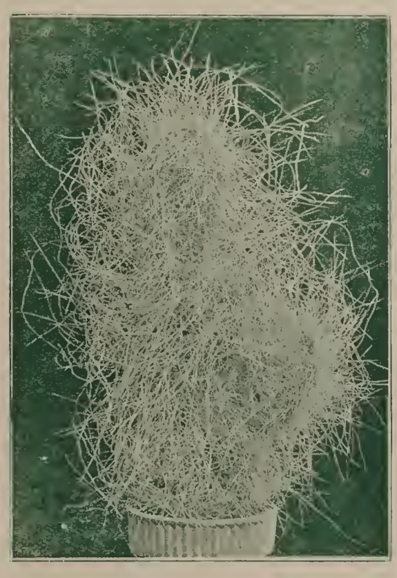
OPUNTIA ERINACEA California's Grizzly Bear